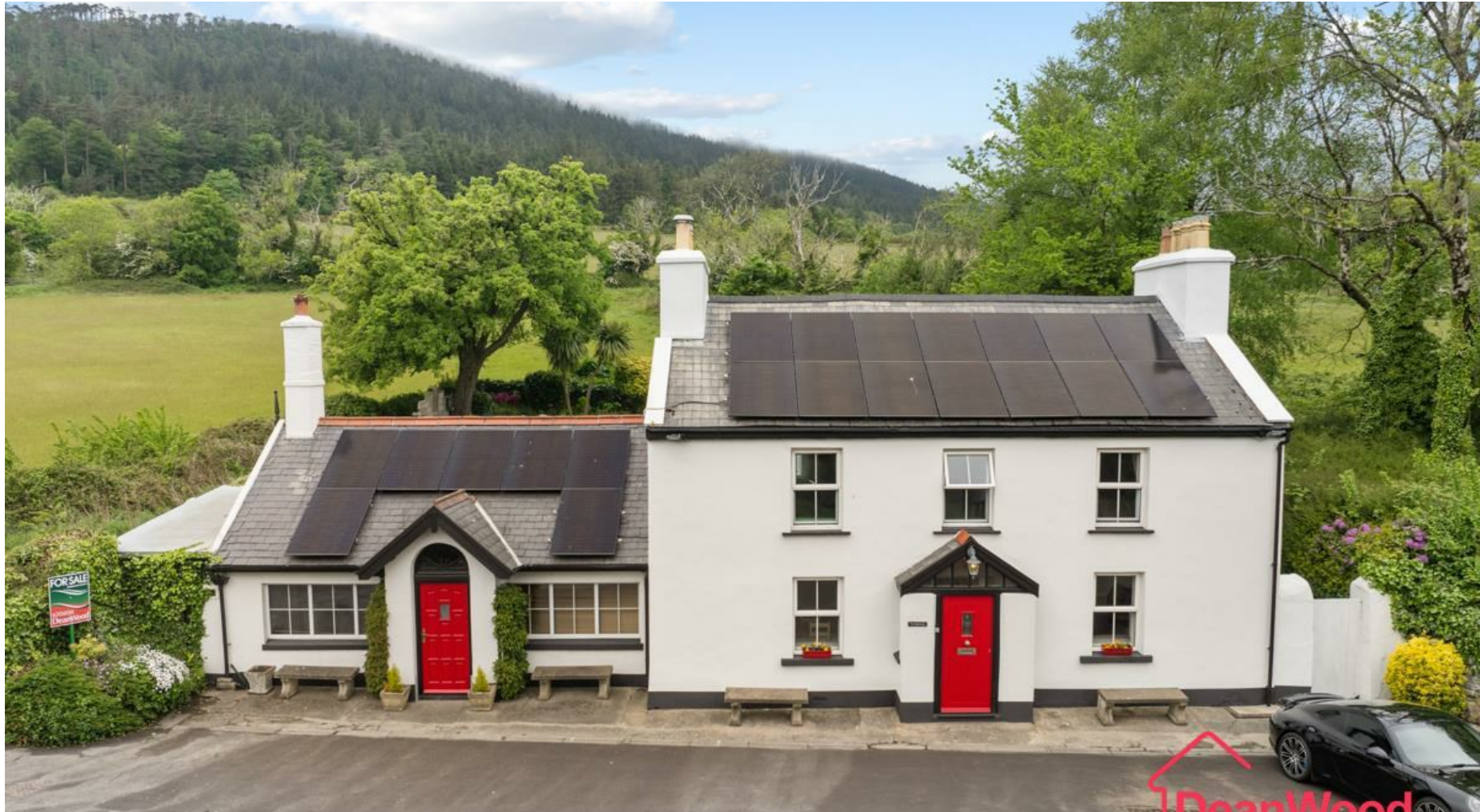
The Highlander Main Road, Crosby, Isle Of Man, IM4 2DP Asking Price £625,000